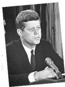
• Salt Lake City

October 27, 2012 Harris Theater, George Mason University Fairfax, VA Campus