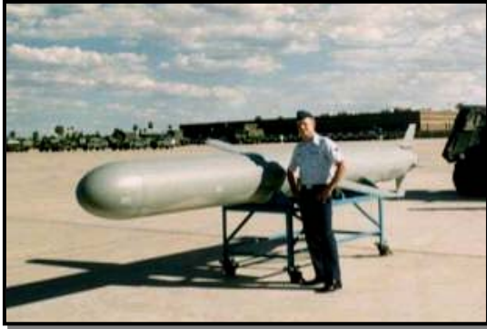
GLCM BGM-109 "Gryphon", circa 1987