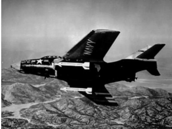
F9F Panther.

The USAF Bomber Command, which provided the main force for Vulture, began preparations. Brigadier General Caldera, who led the bomber strike force, made three overflights of the Dien Bien Phu battlefield in French B-17s and a C-47. Given the shrinking French perimeter, close air support was problematic, but General Caldera believed the mission would have been successful. The operations plan for Vulture was complete by April 24.