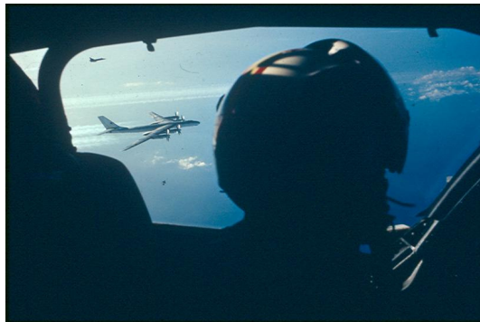
(PHOTO: Cockpit shot from the cockpit of a 57th FIS F-102A. A second F-102 can be seen to the rear of the Bear)