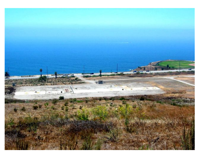
Current view from radar point over White Point LA-43.

Look for another update in an article in the next issue of The Cold War Times. To assist or lend financial support to this preservation, please contact the Cold War Times Editor.