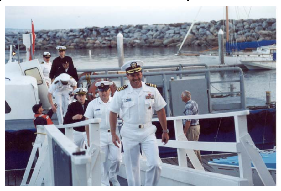
Officers and senior staff of the U.S.S. Sacramento coming ashore for the reception.

We salute the many men and women who served aboard her over the years.